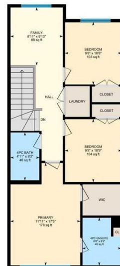
2nd Floor Exterior Area 879.17 sq ft