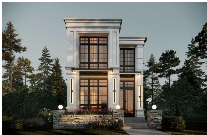
1623 21 Avenue NW (West)

Discover luxury and functionality in this spacious detached infill, nestled in the desirable community of Capitol Hill. Built by the award-winning ACE HOMES, this home sits on an impressive 27.5-foot WIDE LOT, offering over 3,000 SQFT of developed space that combines contemporary design with thoughtful details. With a total of 5 BEDROOMS, this home is ideal for families, multi-generational living, or those looking for rental potential. The layout includes 3 bedrooms upstairs and a 2-bedroom LEGAL BASEMENT SUITE with its own entrance. The main floor is designed for both elegance and convenience, featuring a dedicated dining room, a POCKET OFFICE, a walk-in BUTLERS PANTRY with a prep sink and beverage fridge, and a SOUTH-FACING LIVING ROOM that fills the space with natural light. A spacious mudroom and powder room add to the home's functionality. Upstairs, you'll find a large primary suite with a VAULTED CEILING, a custom COFFEE BAR, and a 5-piece ensuite with upscale finishings. Two additional bedrooms, each with tray ceiling details and their own 3-PIECE ENSUITE, provide a perfect balance of privacy and comfort for family members or guests. The legal basement suite, with separate mechanical room access, is fully equipped with a modern kitchen, including a fridge, dishwasher, OTR microwave, and range, along with IN-SUITE LAUNDRY. The basement's two bedrooms share a full