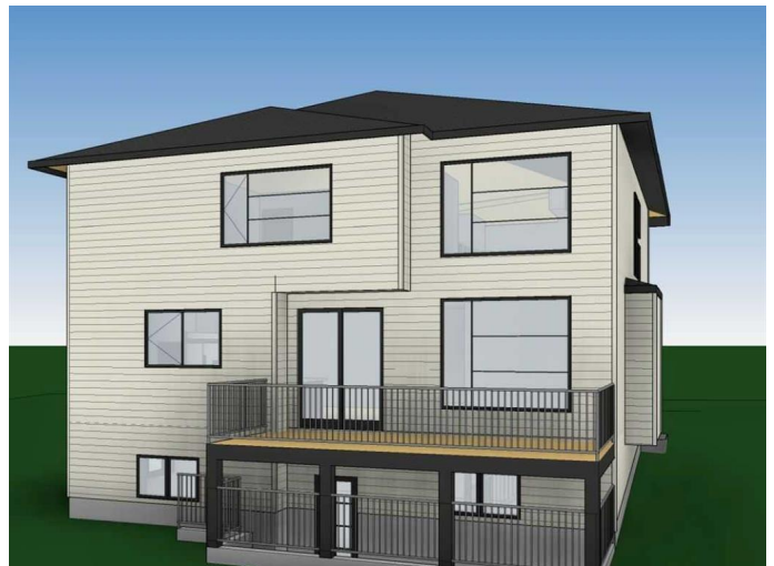
24 N Bridges Glen, Langdon, AB