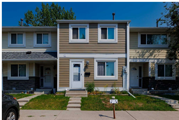
6 Georgian Villas NE, Calgary, AB