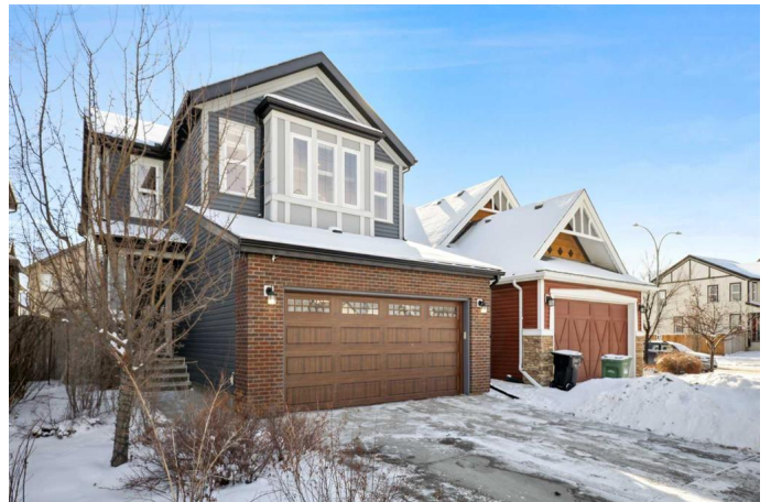
66 COPPERPOND HEATH SE

Family Approved - five bedrooms + two dens ** Extensive upgrades and superior quality, with 3500 square feet of air-conditioned luxurious living space. You will be impressed with the privacy of an oversized traditional homesite with a private south-facing backyard with a bespoke 13' x 12' covered deck. This seasonal, airy design provides relief from the sunniest to the snowiest days while providing an uninterrupted view of the surrounding gardens. Enjoy this convenient Copperfield Location - Steps away from the ponds, Ice rink, parks, pathways, schools, shopping, soccer, skate park, health care, transit, South Pointe Hospital, and the major south expressways. Living a community lifestyle makes Copperfield an outstanding, safe, and secure community. Rich curb appeal with architectural features - dramatic roof lines, 24' x 21' attached garage with wood-style detailed door & full-sized concrete driveway, covered entry, and brick-faced front complete this spectacular elevation. There are extensive upgrades throughout, and the details are superb. This is a must-see home! Chef's™ kitchen includes granite countertops, custom light wood shaker style cabinets/doors, extension trims, high-end KitchenAid stainless steel fridge/dishwasher/microwave/wall oven, gas cooktop range with 5 burners, recessed lighting, oversized central island, peninsula island with a flush eating bar & black granite under mount sink, extra cabinet storage & a